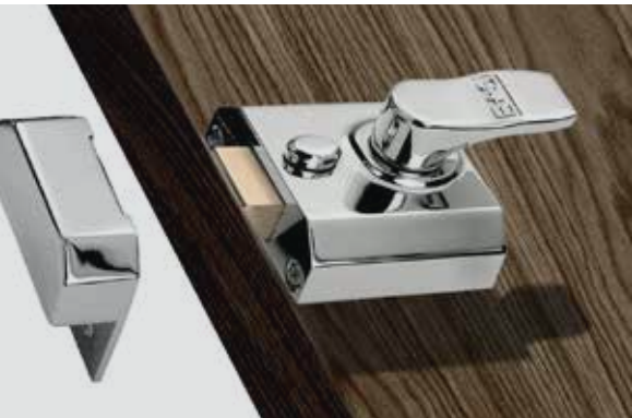
Cylinder rim nightlatch