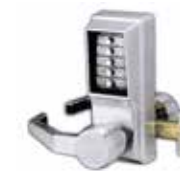
Mechanical digital lock

They are only available as fail unsecure (unlocked) and for this reason they are generally seen as low security solutions. They can be used on inward and outward opening door depending on bracketry used.