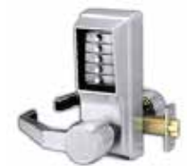
Mechanical digital lock