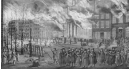
Great Fire of New York City

It is a sad truth that it often takes a significant tragedy to occur to make a real difference to the regulatory regime of a country relating to fire safety.