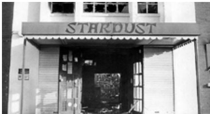
Stardust Nightclub fire, Dublin