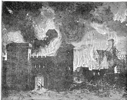
The Great Fire of London

Fire safety measures include those that are planned during the construction of a building or implemented in structures that are already standing, and those that are taught to occupants of the building.