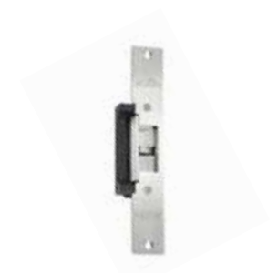
Electrically released strike

"Where necessary in order to safeguard the safety of relevant persons the responsible person must ensure that the premises and any facilities, equipment and devices... are subject to a suitable system of maintenance and are maintained in an efficient state, in efficient working order and in good repair."