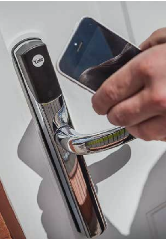
Mobile-operated smart digital lock