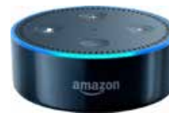
Voice activated device