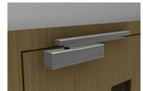
BIM model of door closer

BIM models of products can be downloaded directly in to the Software and used on the project. Many GAI member Companies have already created BIM models on BIMstore or National BIM Library for ironmongery, washroom components or Doorsets.